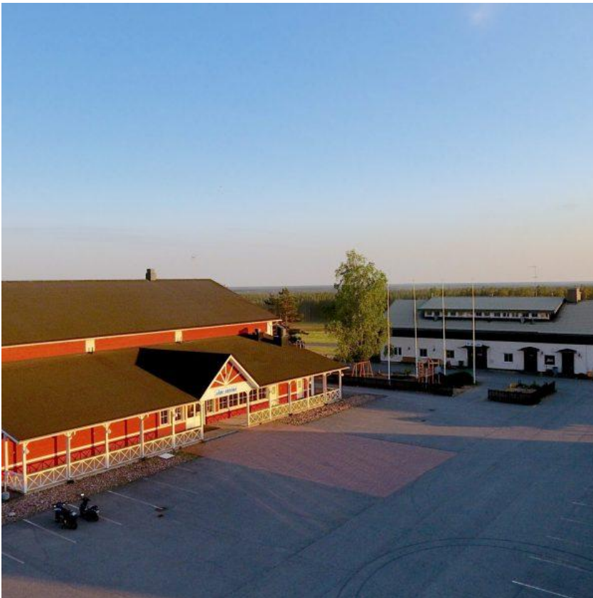
Figure 2. The spacious and heated Jämi Areena provides excellent indoor facilities for the competition center, briefing sessions, and evening gatherings. Its location right next to the airfield and accommodation makes it the perfect base for the EASG 2026 event.

Combined with Jämi's extensive outdoor areas, Jämi Areena makes the venue nearly perfect — a place where both participants and organizers can operate efficiently in all conditions.