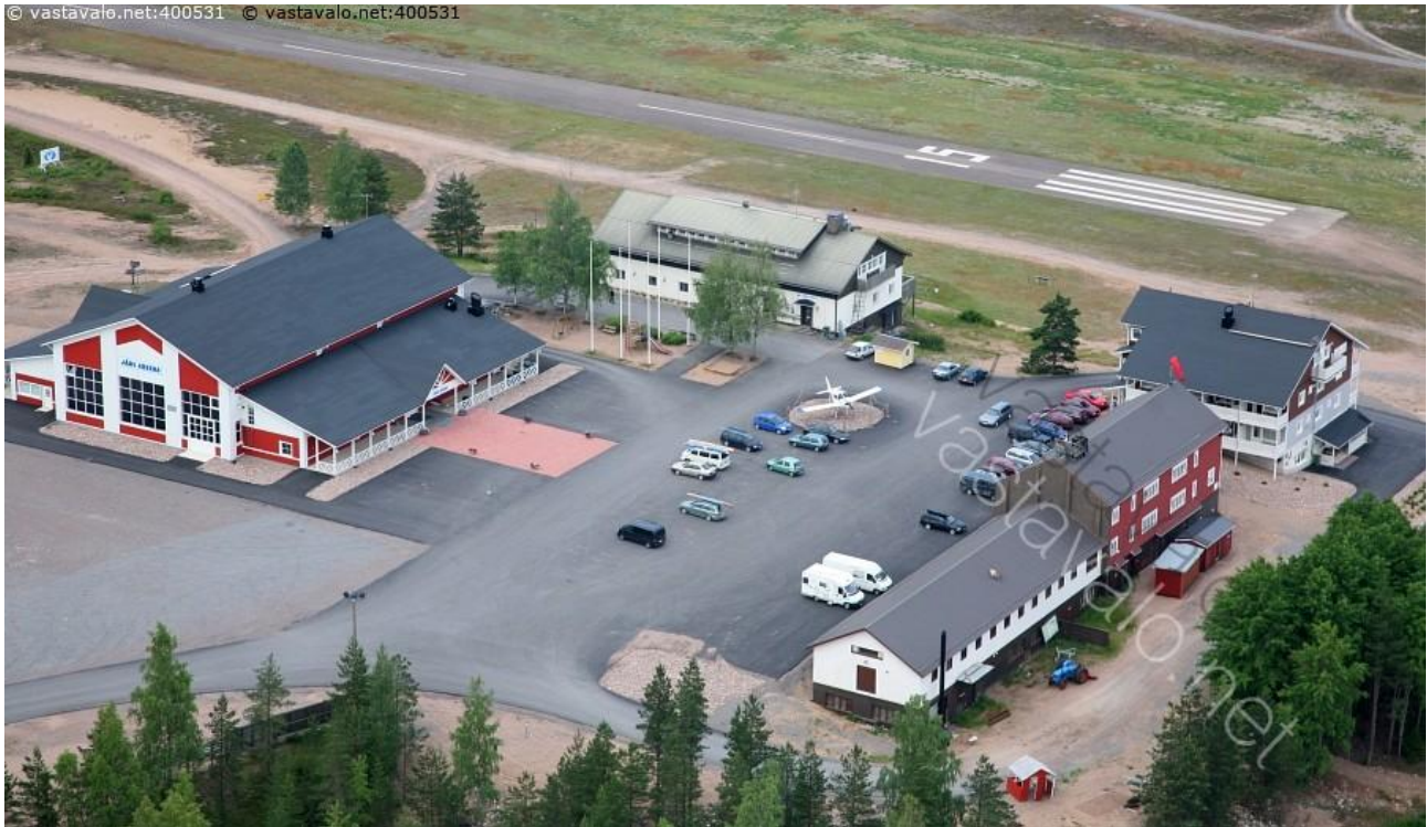
Figure 7. Aerial view of the Jämi Airfield event area.

The photo shows Jämi Arena (left), Jämi Hotel and Restaurant (center), and Hotel Reima Country Center (right) — all located only a few dozen meters from the runway. The compact layout and proximity of all key facilities make Jämi an exceptionally convenient and efficient venue for EASG 2026.