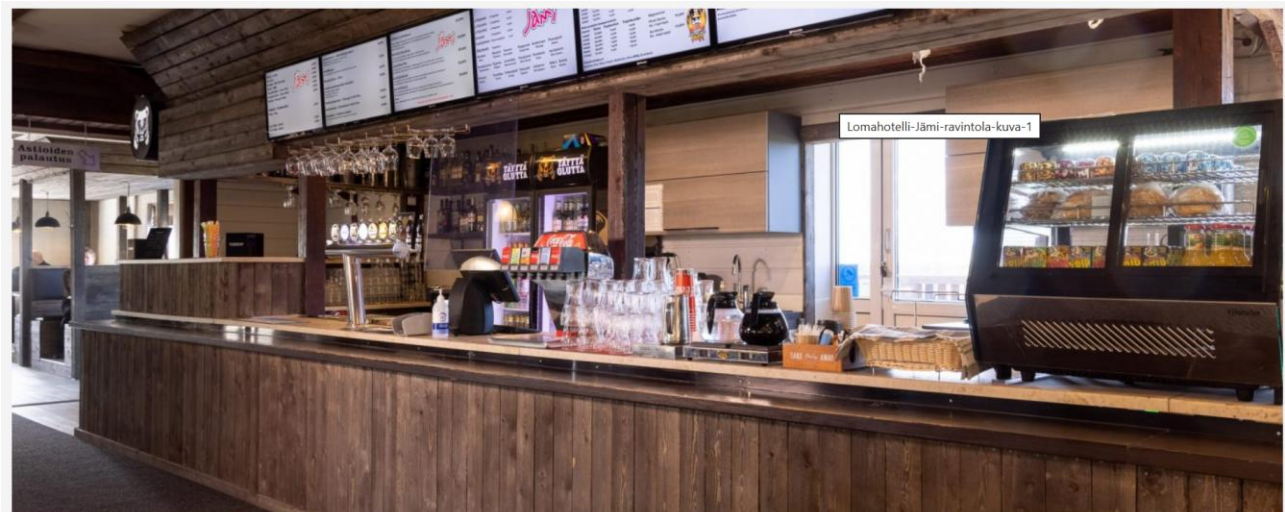
Figure 1. The restaurant connected to Jämi Hotel offers tasty homemade meals, snacks, and refreshments in a cozy setting right next to the airfield. The spacious and welcoming dining area serves both competitors and visitors, providing breakfast, lunch, and dinner conveniently in one place. The restaurant also features a bar and comfortable lounge areas for evening gatherings and social events.