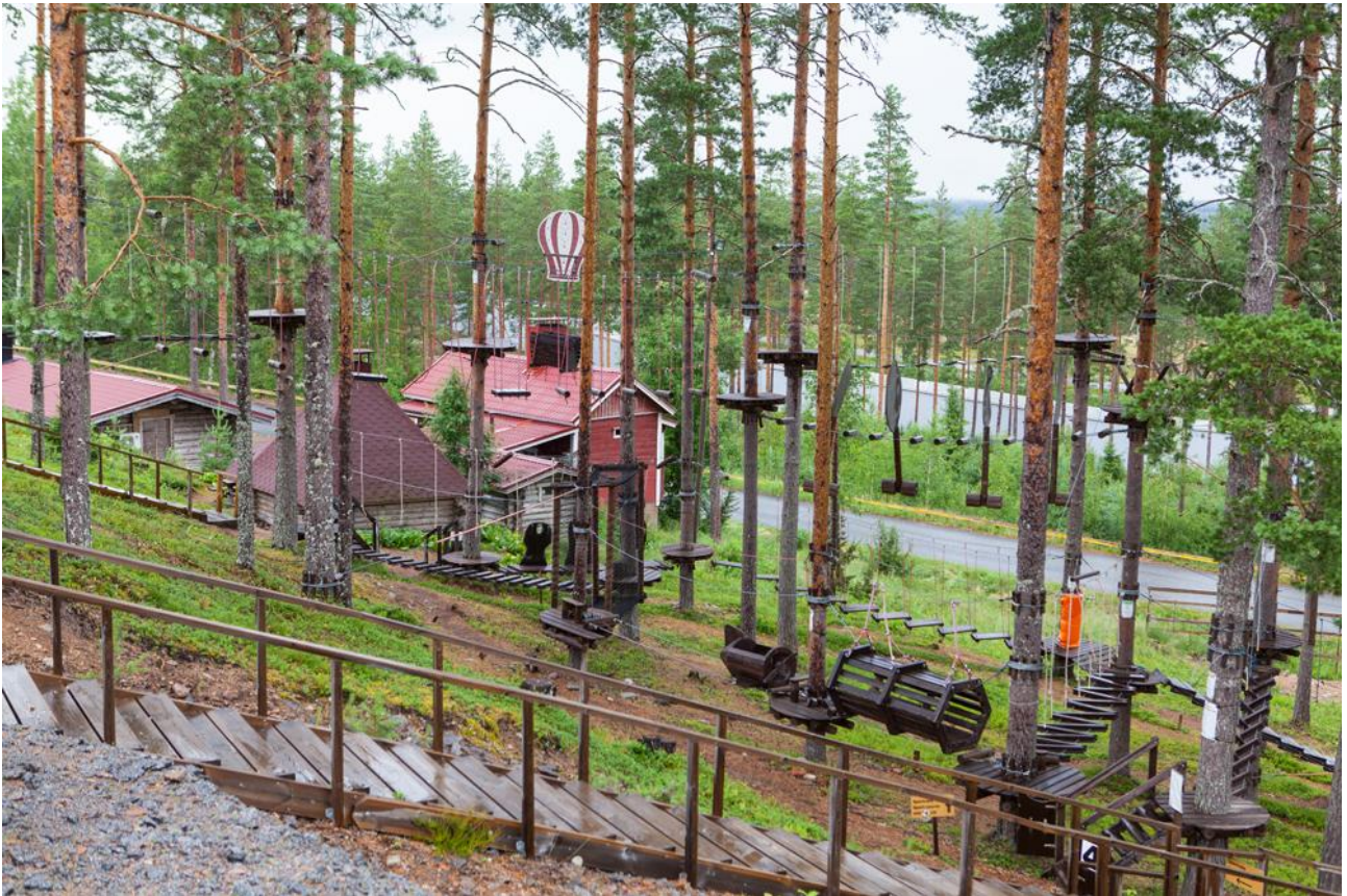
Figure 3. Jämi Adventure Park, located near the airfield, offers exciting activities for visitors of all ages. The park's climbing courses and adventure trails set among the pine forests provide a fun and active experience for families and companions during the EASG 2026 event.

This makes Jämi not only an outstanding competition venue but also a great holiday destination for the whole family during the EASG 2026 event.