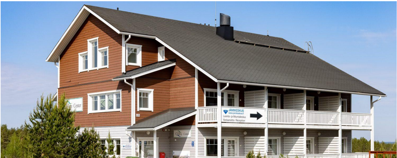
Figure 4. Hotel Reima Country Center offers comfortable accommodation just a short walk from the Jämi Airfield and competition area. The building features cozy rooms, a sauna, and lounge areas for relaxation after the competition day. With restaurant services on-site, it provides a convenient and pleasant stay for EASG 2026 participants and guests.

→ Reima Country Center completes the Jämi service package – accommodation, dining, and relaxation all conveniently close to the event venue.